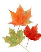
Autumn E. 10 years